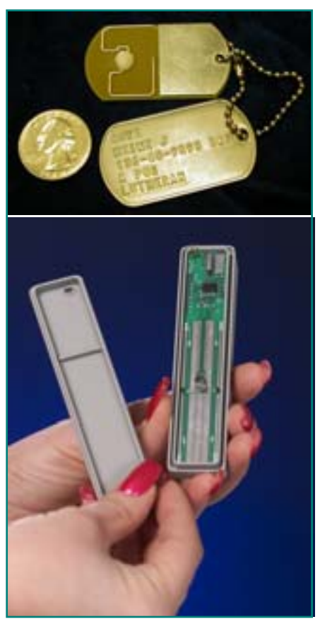
Researchers at the Pacific Northwest National Laboratory are developing miniature radio frequency tags—from passive to fully active that are ideal for tracking, inventorying, and monitoring a variety of items.

PNNL's miniature passive tags, used to track the location of everything from large shipping containers and rail cars to clothing, provides an inexpensive method of tracking vital commodities. Laboratory scientists have modified commercially available tags that use a tiny microchip with micro-antennae to store information about an item. The tag, which has no battery, is attached to an item and then can be read by a reader and special software.